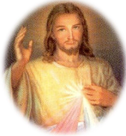
Second Sunday of Easter Divine Mercy Sunday

Join us for some private prayer from your own home each Tuesday, Friday and Sunday from 3 – 4 p.m. via the parish webcam. ( www.arklowparish.ie or www.mcnmedia.tv )